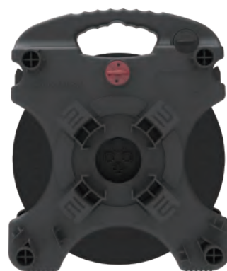
Sample of AOC label