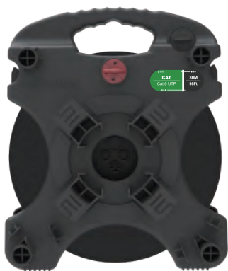
Sample of CAT cable label