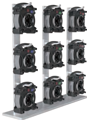
Hung on racks