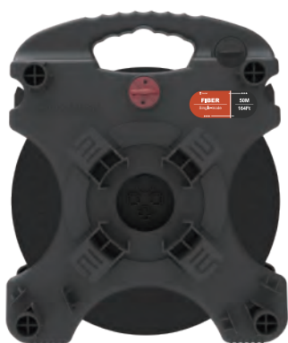
Sample of fiber cable label