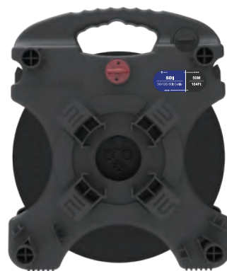
Sample of video cable label